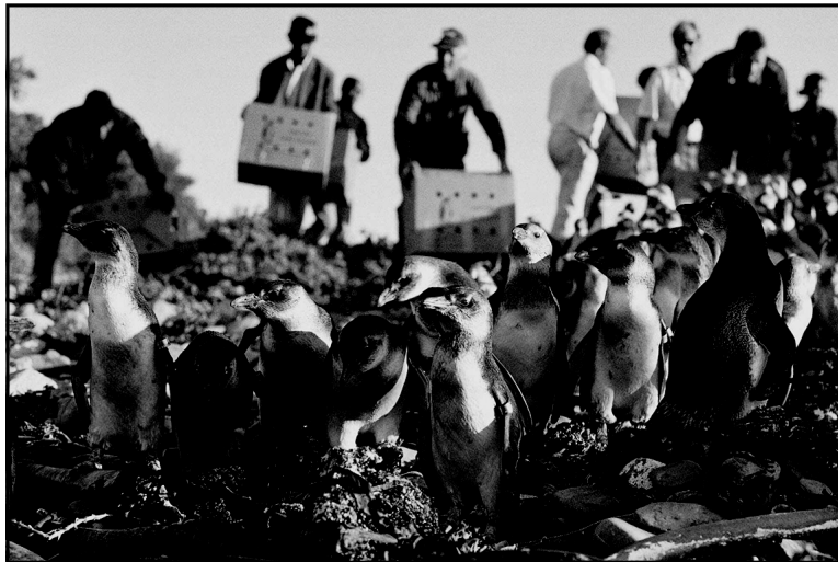
© AP Photo/Jon Hrusa. Used by permission.